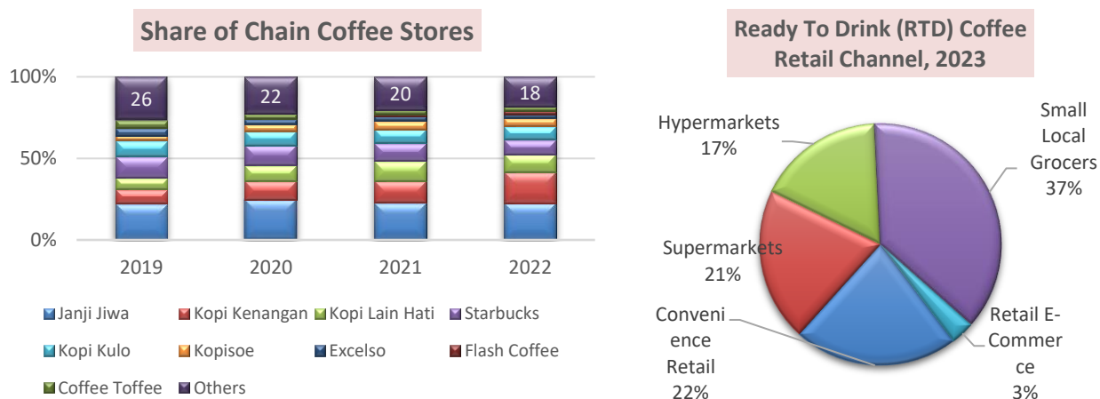
Figure 1. Shares of Chain Coffee Stores and RTD Coffee Retail Channel

Coffeehouse chains remain the dominant outlet for coffee consumers, offering various products for low and high-end consumer groups. These coffeehouse chains expanded in the past few years and is expected to survive despite the weakened consumer purchasing power. In addition, the expansion of non-coffeehouse chains in the retail coffee sector (i.e., supermarket cafes, convenience stores, hypermarkets, etc.) is expected to increase competition.