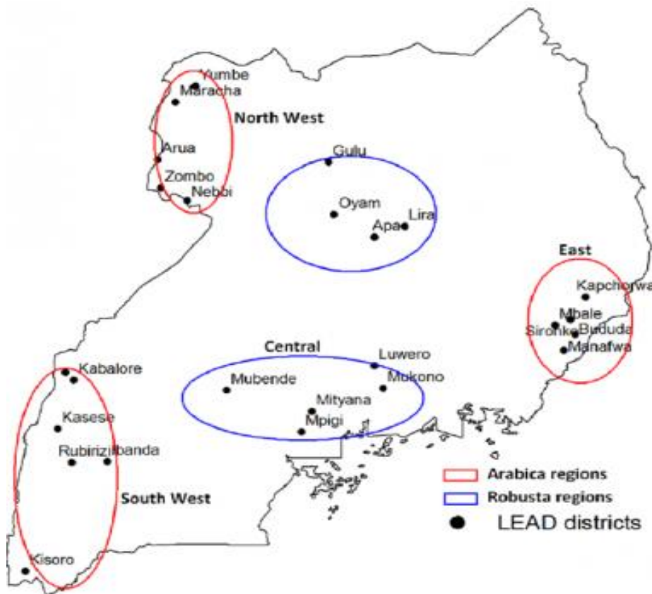
Figure 2: Map of Major Coffee Growing Areas in Uganda

The Western region, encompassing districts like Kasese, Bushenyi, and Bundibugyo, produces both Arabica and Robusta coffee, with the Rwenzori Mountains providing ideal conditions for specialty Arabica varieties. Northern Uganda, historically a non-coffee-producing region, is now emerging as a coffee hub, particularly in Zombo, where high-altitude Arabica coffee is now growing in abundance.