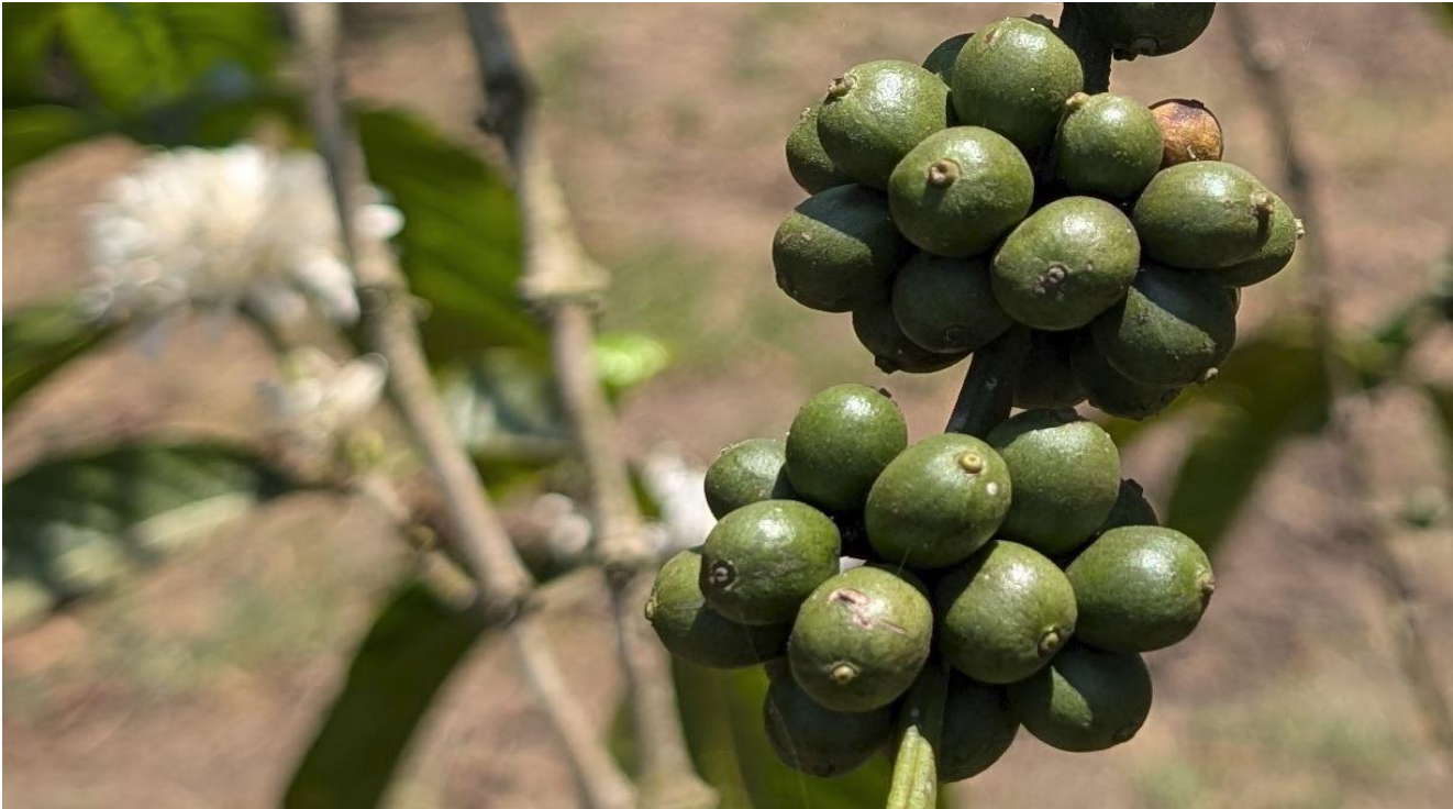
Figure 4: Coffee Tree with Flowers and Berries