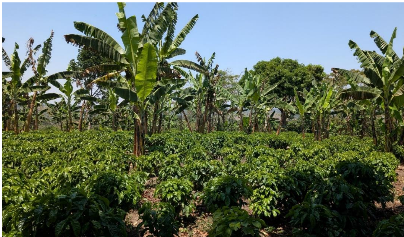
Figure 3: Typical Coffee Farm in Uganda