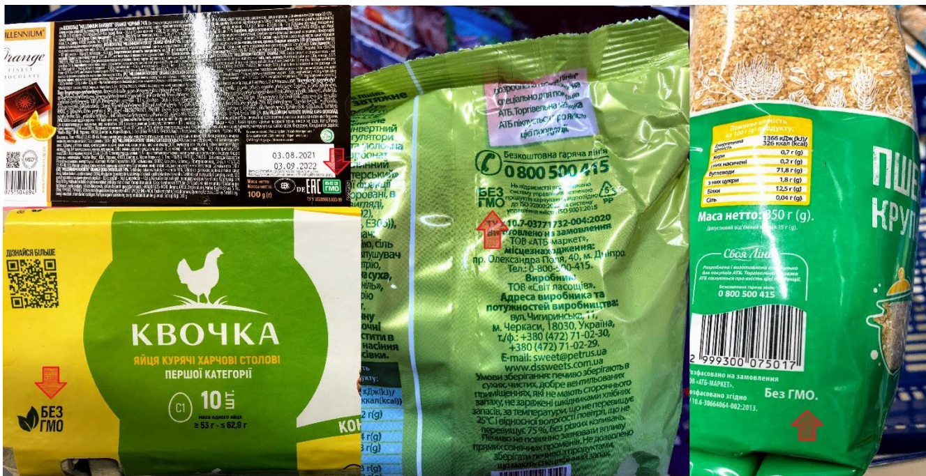
The retail packaging of various commodities: chocolate, chicken eggs, cookies, and cereals (from left, down to right) bearing various designs and placement of “GMO-free” labels, indicated by red arrows.

The GOU discontinued the “GMO-free” compulsory labeling for products that do not contain GE traits. However, producers/importers may choose to use a “GMO-free” label. In this case, the absence of GE material must be confirmed as stipulated by existing laws and regulations. The lack of information about the presence of GE traits from ingredient suppliers may serve as a sufficient reason for such labeling.