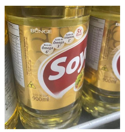
Figure 2: Brazilian supermarket showing the GE label "T"

2003 by Ordinance 2658/03<sup>13</sup>. The withdraw requirement PLC 34/2015<sup>14</sup> is still under consideration in the Brazilian Senate and the last movements on it were in December 2023 to be resumed, but no further steps were taken until. Thus, the referred Decree remains in force, and it applies to bulk shipments, raw material, packaged food, feed, or other products derived from and/or containing ingredients from GE plants. The content above one percent does not differentiate between products containing DNA and those that do not. The requirement became effective on February 27, 2004.