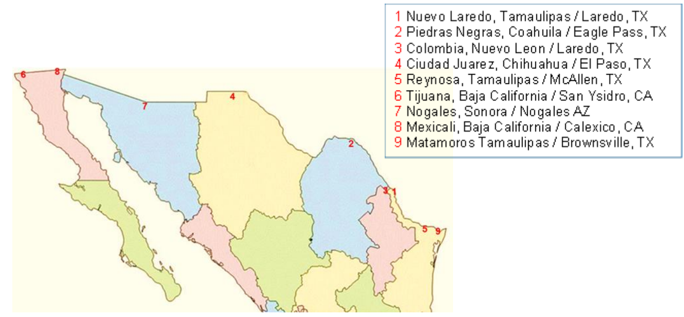
Fig. 1 Geographical location of the Principal Ports of Entry for US Agricultural and Food Products ranked by order of importance.

The reader should be aware that live animals destined for Mexico are always inspected on the U.S. side of the border at state-owned or privately -owned livestock pens authorized by SENASICA. On the other hand, Mexico's Animal Health Law requires that imported animal products and animal by-products, for human and animal consumption be inspected upon entry to Mexican territory at verification and inspection points located on the Mexican side of the border. As of this date, other agricultural products like fresh fruits and vegetables, propagating material, cotton and grains (not transported by rail) are normally inspected on the U.S. side of the border, but can also be inspected at approved VIPs on the Mexican side of the border. Having said that, SENASICA is working towards closing VIP's on the US side of the border for plant and plant products. As these happen, ATO/Monterrey will be issuing periodic updates.